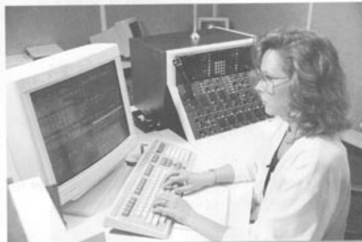
The rapidly expanding percentage of our population over the age of 75 will continue to increase the demand for Health Service Administrators.

General Education hours that are specific to the Health Care Administration degree program are: English 6 hours*; Speech 3 hours; Math 3 hours*; Computer Science 3 hours*; Social, Political and Economics 9 hours; Humanities 6 hours; Literature and Fine Arts 6 hours; Natural Science 6 hours; Philosophy 3 hours. Those courses identified by an (*) are prerequisites to the Health Care Administration courses.