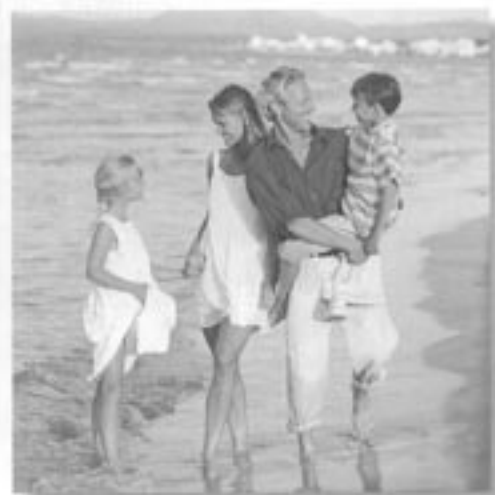
CSU allows you to honor family and career obligations while steadily completing your studies.

Simply put, if you are to thrive and prosper in this new era, you must commit to systematic and ongoing education. Excellence is never an accident — Excellence is a planned event.