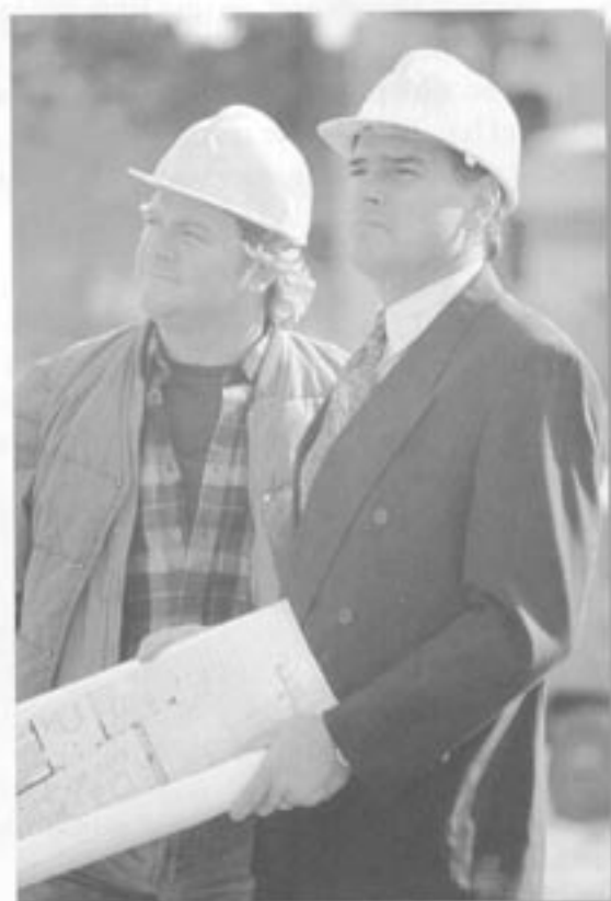
The growth of career opportunities and the demand for qualified professionals has increased the need for education in the field of Occupational Health and Safety.

General Education hours that are specific to the Occupational Safety and Health degree program are: English 6 hours (*); Communications 3 hours (*); Humanities 6 hours; Literature and Fine Arts 6 hours; Math 6 hours; Social Sciences 6 hours (*); Natural Sciences 6 hours(*); Philosophy 3 hours. Those courses identified by an (*) are prerequisites to the Occupational Safety and Health courses.